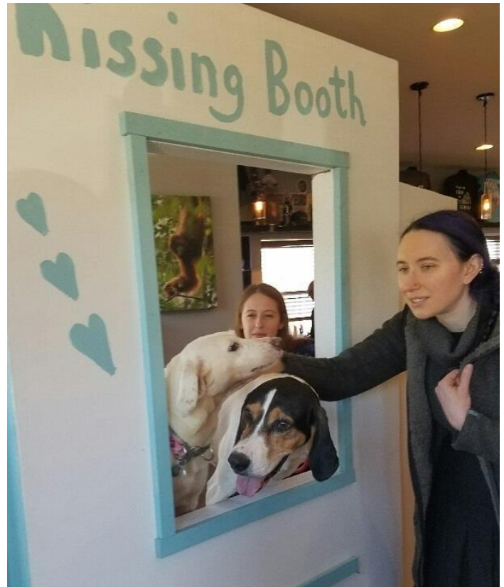
The kissing booth at Silverback Distillery.

Almost Home greatly appreciates Silverback Distillery's support of our shelter and think they are a fantastic group of dog lovers!