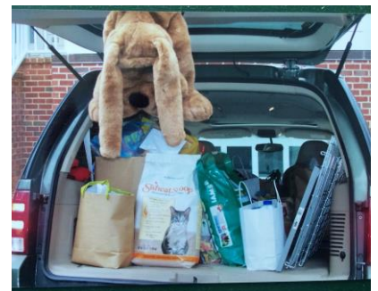
The 'Critter Coffee' event resulted in lots of donations.

Everyone at Almost Home was so surprised and delighted when they arrived with the donations. The Critter Coffee is a unique and fun way to help, and Almost Home is so pleased they came to us!