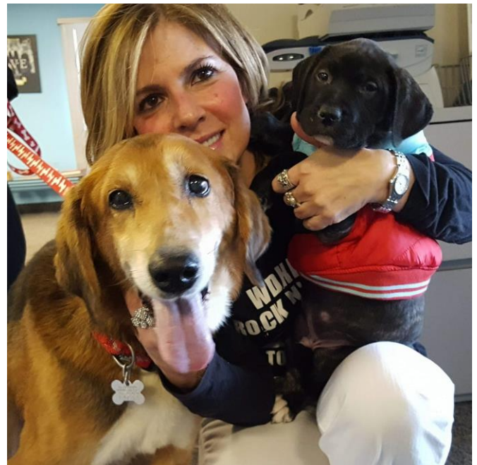
Amos, the dog at left, is helping families who are grieving their lost pets.

Amos surely had a larger purpose in this world than anyone could have imagined. He was already great but now he helps heal broken hearts for people that loved and lost their pets.