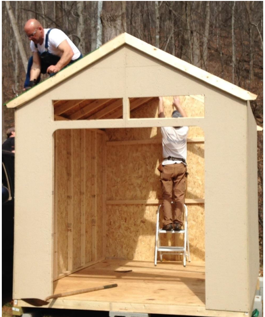
Volunteers got together to put up the shed for feral cats, one made possible by the generosity of Delfosse Vineyard.

We would like to thank Wegmans for its $1,000 donation to our feral cat program.