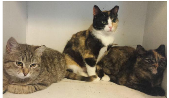
Young ferals we are working to socialize.